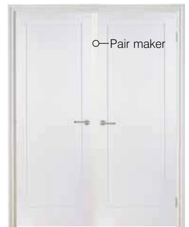
Flush pair example