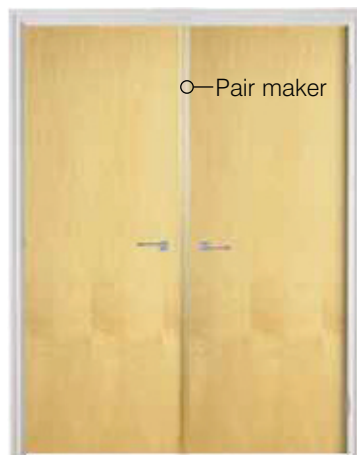
Flush pair example