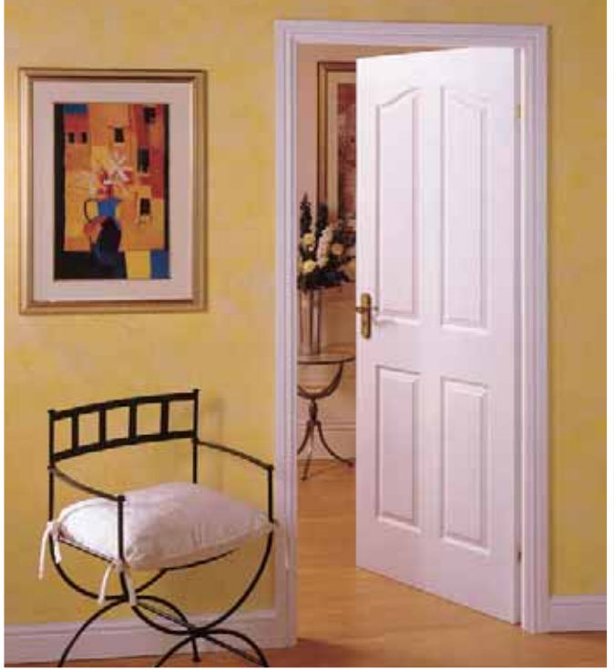
4 PANEL ARCH TOP TEXTURED

Optional Premdor aperture details are shown on pages 5, 26 and 50.